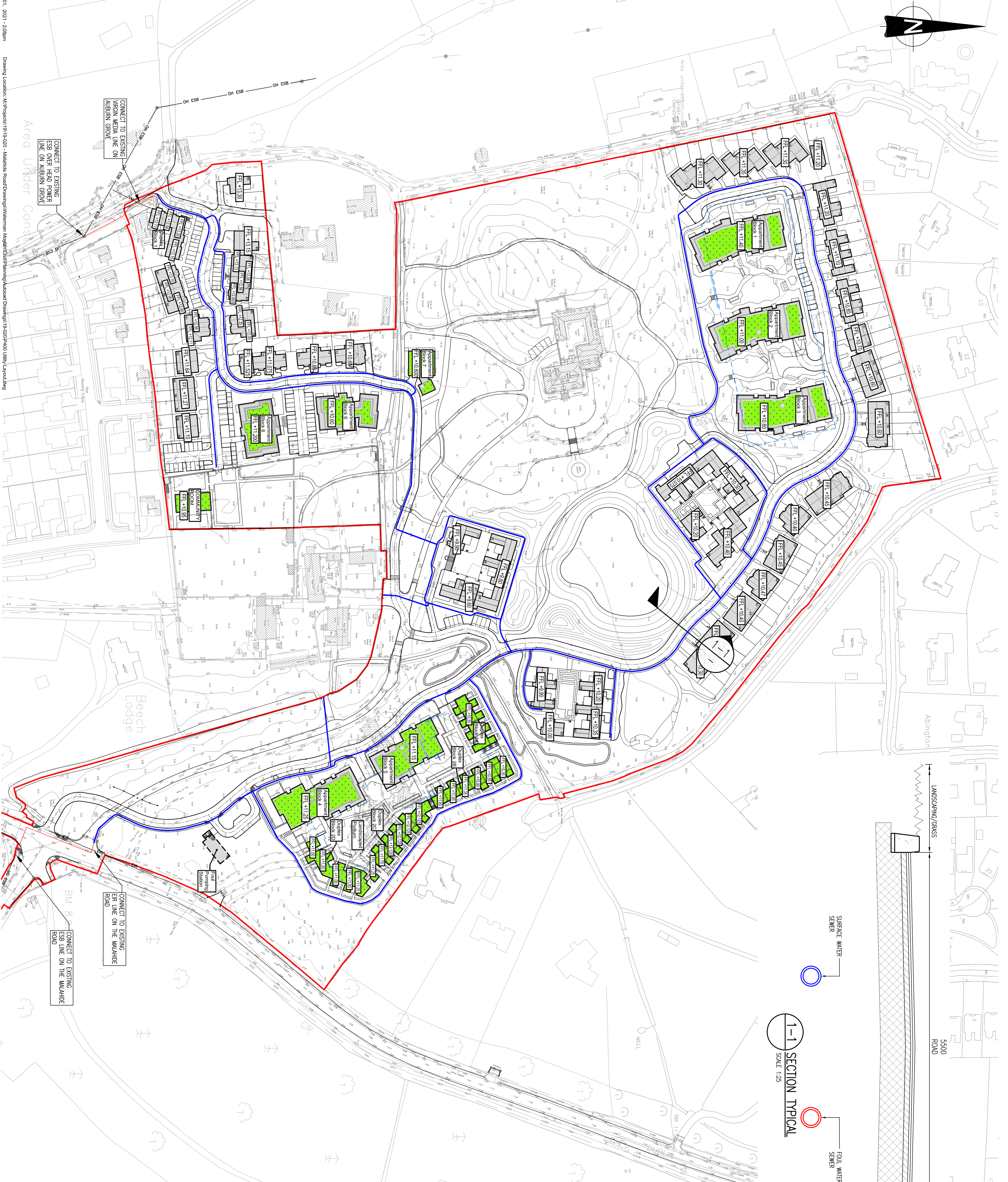
1-1 SECTION TYPICAL SCALE 1:25

Apr 01, 2021 - 2:08pm Drawing Location: M:\Projects\1919-2020 - Malahide Road\Drawings\Waterman Moylan\DWG\Planning\Waterman Moylan\DWG\1919-2020\400 Utility Layout.dwg